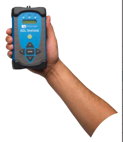
ADL Vantage Compact and Easy to Use