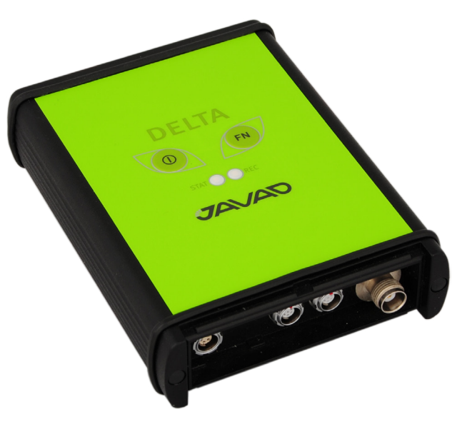
Figure 1. DELTA-3

DELTA-3 can operate as a receiver for post-processing, as a Continuously Operating Reference Station (CORS) or portable base station for Real-time Kinematic (RTK) applications, and as a scientific station collecting information for special studies, such as ionosphere monitoring and the like (Fig. 1).