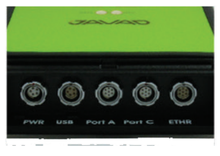
Figure 4. DELTA Ports

Below are presented some examples of possible configurations: