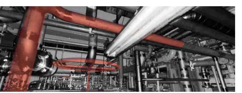
BubbleView® in LFM

The high resolution allow the S-3180V to "freeze" scenes rapidly for later analysis and in extraordinary quality. In this case, the data serves mainly for preserving evidence and documenting damage. This leads to great time savings for accident reconstruction and many other insurance purposes.