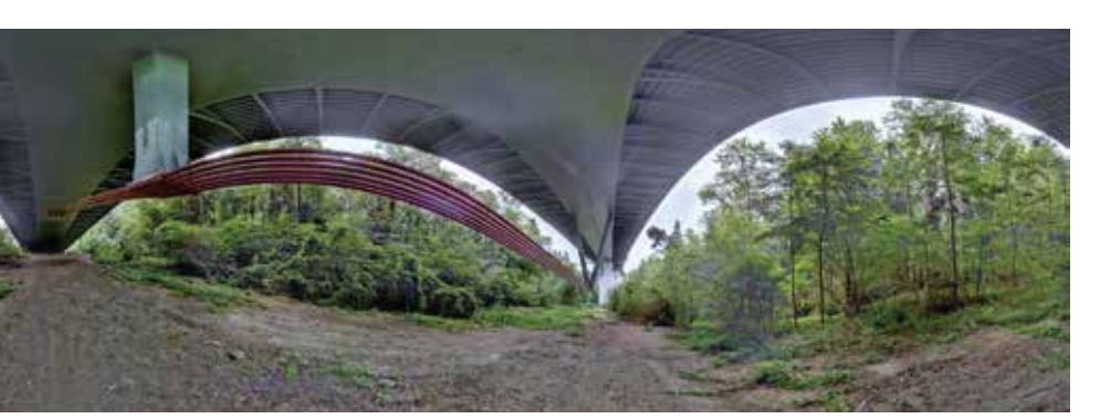
Coloured scan with the integrated HDR Cam

The PENTAX Scanning System sets an impressive record in this field because of its contact-free, and above all rapid measuring ability. This reduces costs tremendously in comparison to traditional measurement systems. The integrated i-Cam enables the whole point cloud to be coloured, which gives a photorealistic impression of a scan with a high level of detail.