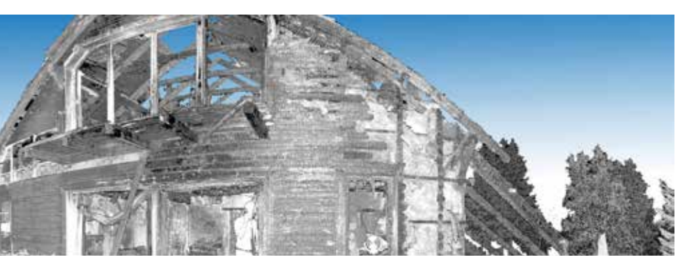
3D point cloud of a burnt restaurant