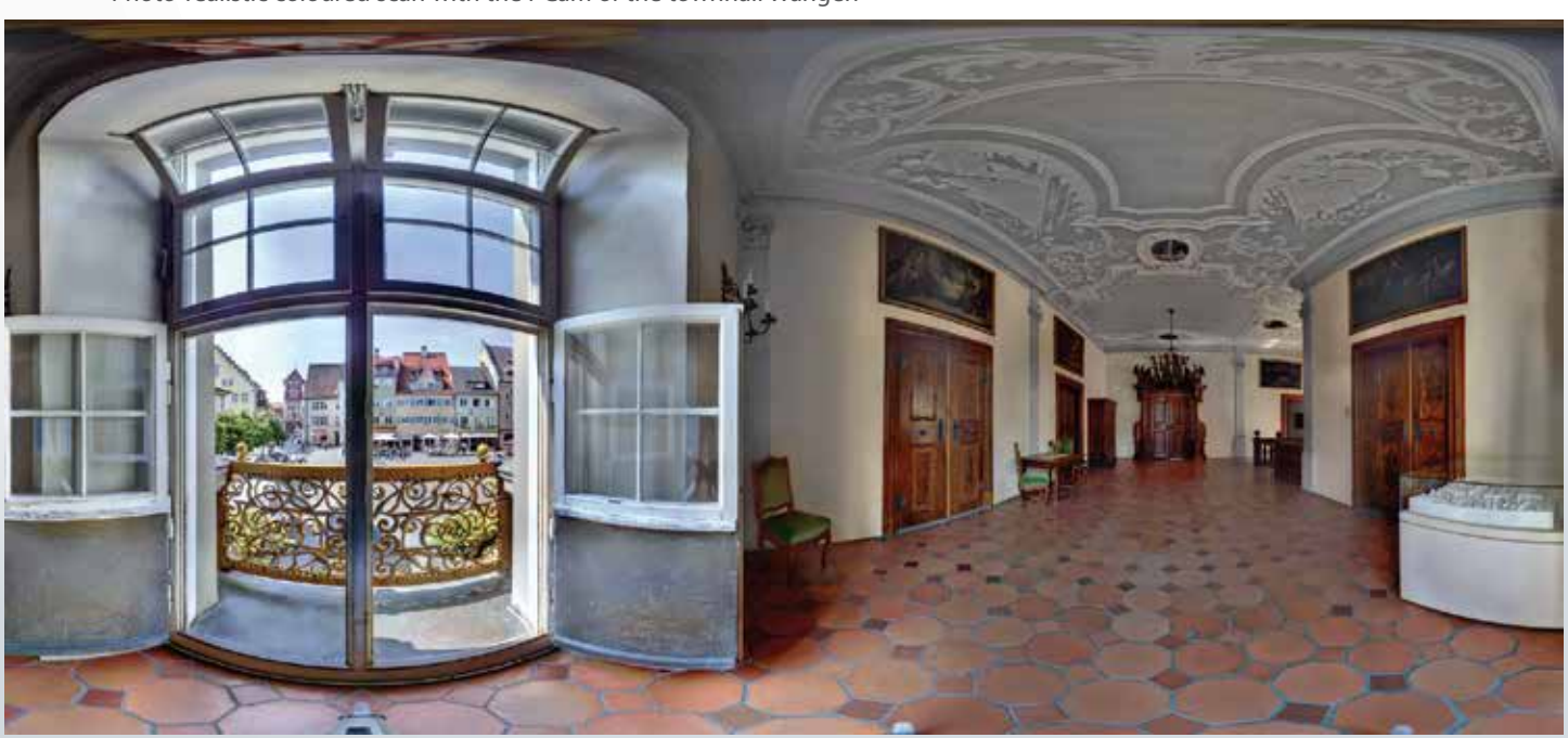
Photo-realistic coloured scan with the i-Cam of the townhall Wangen