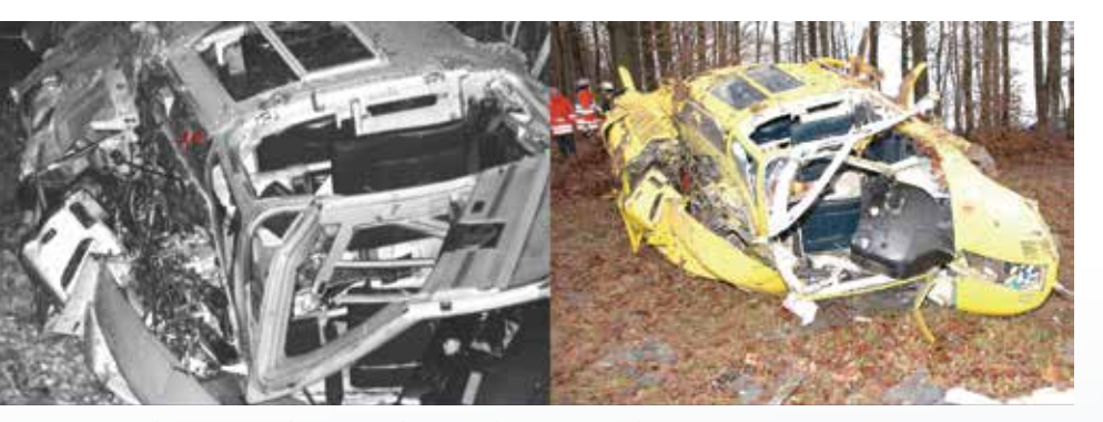
Helicopter crash Regional CID Baden-Württemberg

The 3D phase based laser scanner S-3180V enables a detailed condition and damage assessment of the current status of a building or complex structure and its surroundings. From the 3D data it is easy to create 2D floor plans or views of the object to plan building or conversion projects.