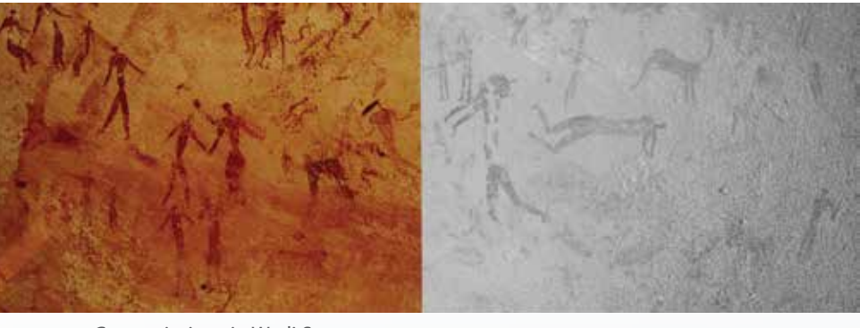
Cave paintings in Wadi Sura

S-3180V extreme speed reduces downtimes of industrial plants to a minimum. The high level of detail facilitates modeling of extraordinary accuracy. This enables a subsequent comparison between the revamp design and the as-built site. The scanner can also operate in a temperature range of -10 °C to +45 °C.