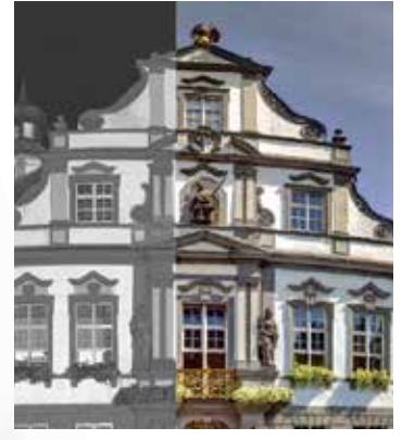
Town hall Wangen in Allgäu in 3D view

The S-3180V can also take colour images without any set-up times.