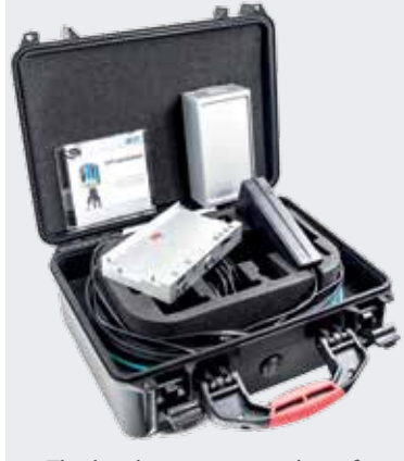
The hard case ensures the safe storage of the accessories

Every S-3180V laser scanner comes complete with an accessory case that includes the following items: